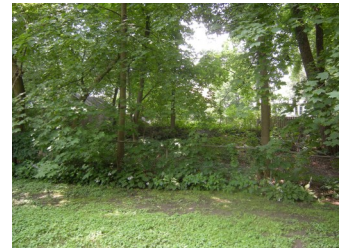
The 4 foot high fence

Deer are present in lots of suburban/urban places in the Capital District. In Schenectady, I've seen them or their sign in Vale cemetery/park, Central Park, Schenectady Municipal Golf Course, etc. Deer can easily jump over most fences, and the back yards in many neighborhoods are continuous open space.